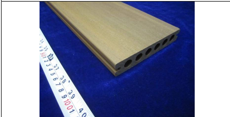
Section view of UH02