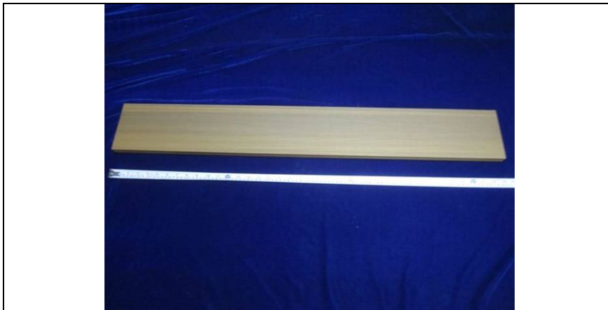
Front view of UH02 (tested surface)