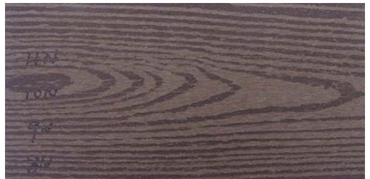
CONVENTIONAL 8N: MARK APPEARS