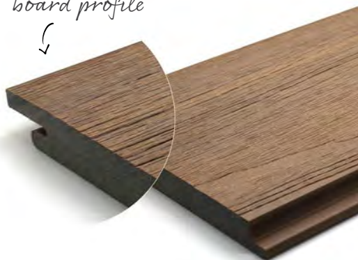
ShadowLine Cladding board profile

Fully finished exterior wall cladding requires no oiling or painting.