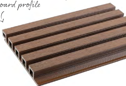
Castellation Cladding board profile