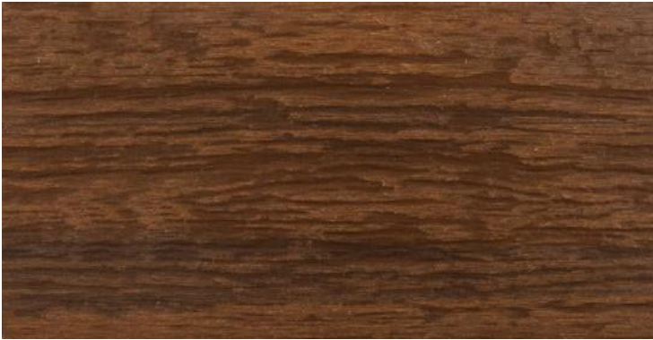
Pattern H59 photo